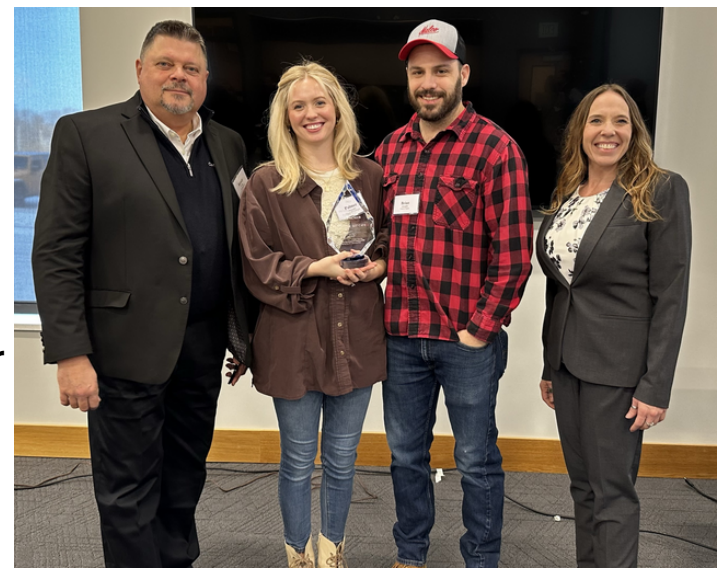
2023 WCEDP Start-Up Entrepreneur of the Year Forget Me Not Cafe Photo to the right