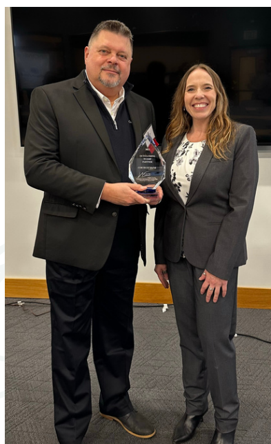
2023 WCEDP Partner of the Year CorTrust Bank Photo to the left